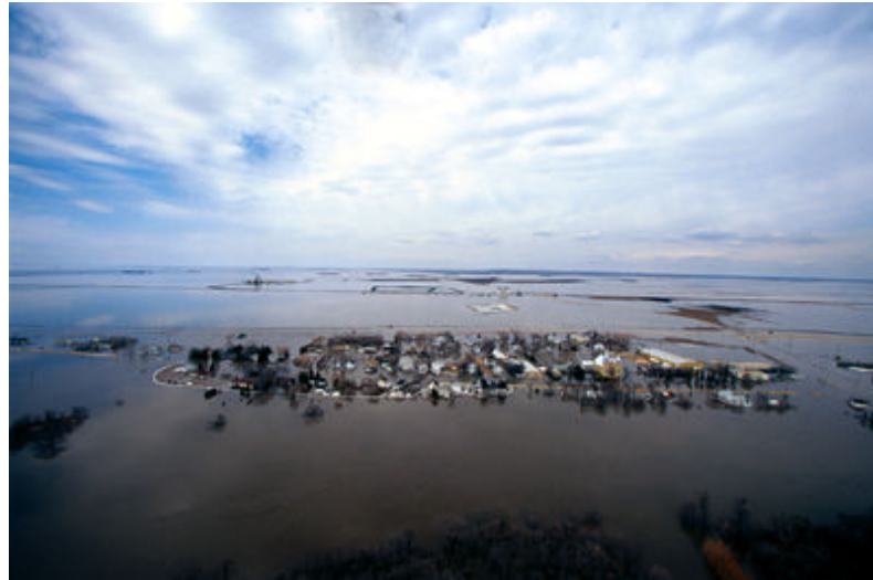
(above) The Red River in southern Manitoba floods regularly. A massive flood extending from mid-April to early May 1997 flooded 1950 km 2 of land and resulted in the evacuation of 30 000 Manitobans. Some 8600 troops were mobilized to assist civil authorities.