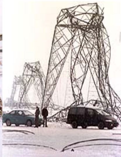
(above) The Ontario-Québec ice storm of January 1998 caused the deaths of 25 persons through hypothermia, asphyxiation and fires induced by overheated stoves.